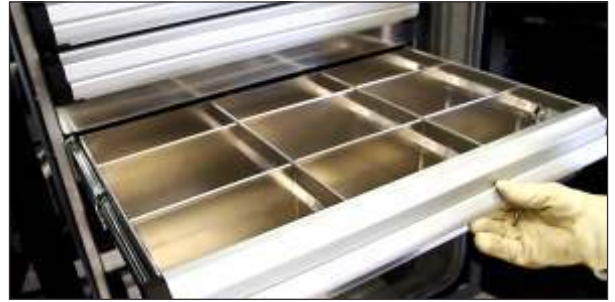
ONE CLICK locks the drawer open!