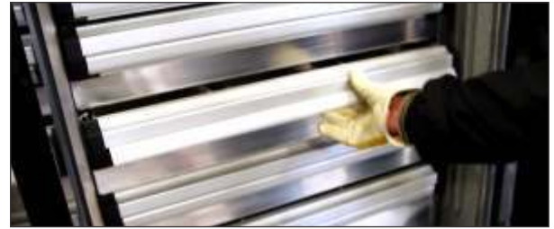
ONE CLICK unlocks the closed drawer...